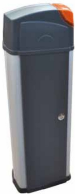
Barrier automation with integrated control unit