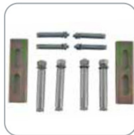
Fixing ground plate