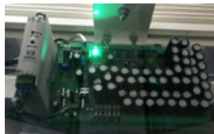
Super capacitors main control board