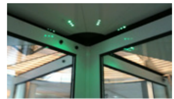
Green Ambient Feedback

The revolving door concept, 'Always open, Always closed' is the first step to saving energy... generating energy is the next!